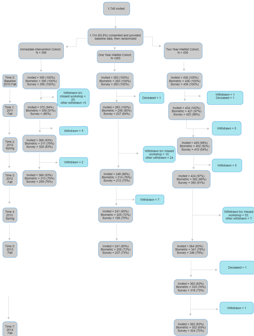
Figure 1. Trial profile: Cardiometabolic (biometric) and survey data collection at each assessment point during the 48-month study.

outcome missing data pattern is either missing completely at random or a covariate-dependent missing pattern, and the predictors of missing outcomes are included as covariates. Doubly robust multiple imputation was performed to test whether the results were robust to missing data. The use of this procedure did not substantively alter the results (Appendix Table 1, available online).